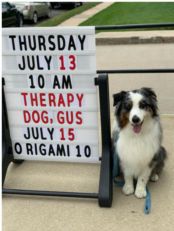
Summer Reading Program concludes for 2023